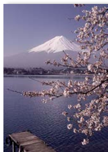
Mount Fuji in Japan is framed here by a spring bloom of cherry and plum blossoms.

America’s most famous version of hanami begins every March in Washington, D.C. In 1911, the city of Toyko gifted 2,000 cherry trees to the U.S. Sadly, those trees were infested with insects and had to be destroyed. But Tokyo mayor Yukio Ozaki was undeterred. He sent a new shipment of 3,020 cherry trees, which arrived in Washington on March 26, 1912. Visitors have flocked to Washington, D.C.’s Tidal Basin to enjoy the cherry blossoms ever since.