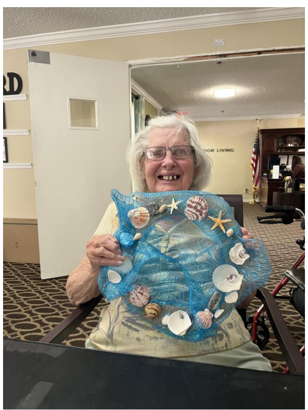
Seashell Wreaths was a great way to kick off summer!