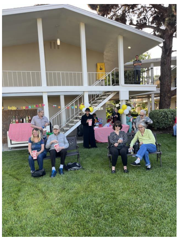
Popcorn Bar, beverages and great music!