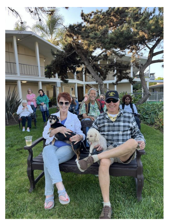
Concert in the Park with wonderful company!