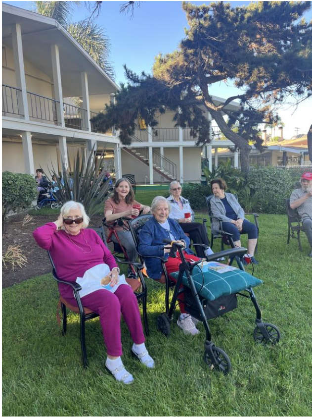
Concert in the Gardens