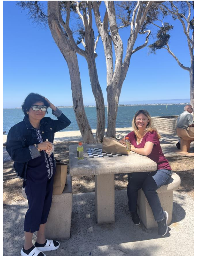
Picnic on the Pier