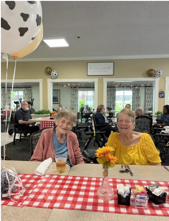
July Birthday Celebration