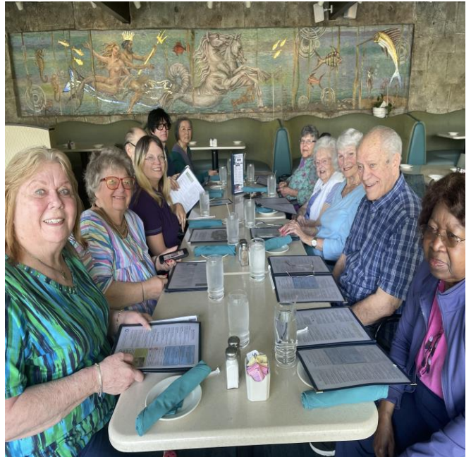
Lunch at Anthony's